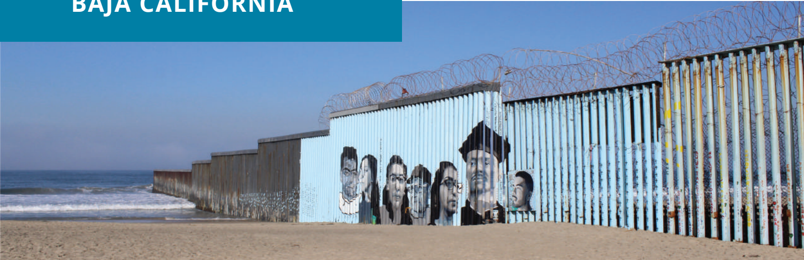
Muro Fronterizo, Tijuana - San Diego